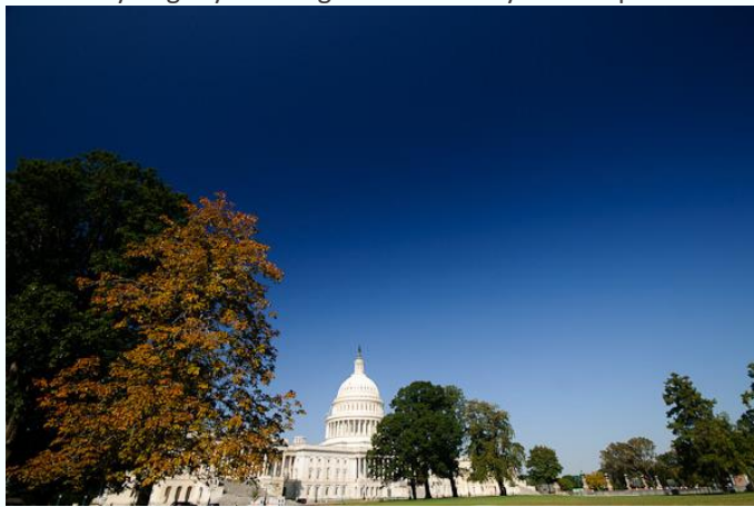
10mm (15mm equiv) | f/11 | 1/125 | Circular Polarizing Filter

“...there’s another one to look out for with polarizers: they don’t work well on extreme wide-angle lenses . That’s not to say they don’t work at all, just that they need to be used with care. It’s a problem of physics. The polarizing effect is directly related to the angle from the light source. Extreme wide-angle or fisheye lenses can cover an extraordinarily wide field of view—up to 180° in a few cases. So if a lot of your frame is blue sky, there’s a good chance you’ll end up with bands of lighter and darker shades across the sky. A further complication is that you won’t really see the full effect through the viewfinder, and it’s not always easy to see on the camera’s LCD screen with all its reflected light. So you might not notice it until you get your images home onto your computer.