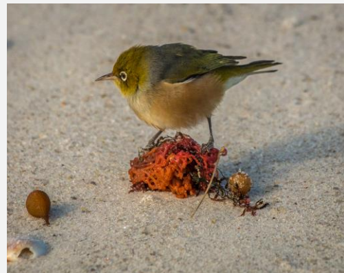
Silvereve on Seaweed