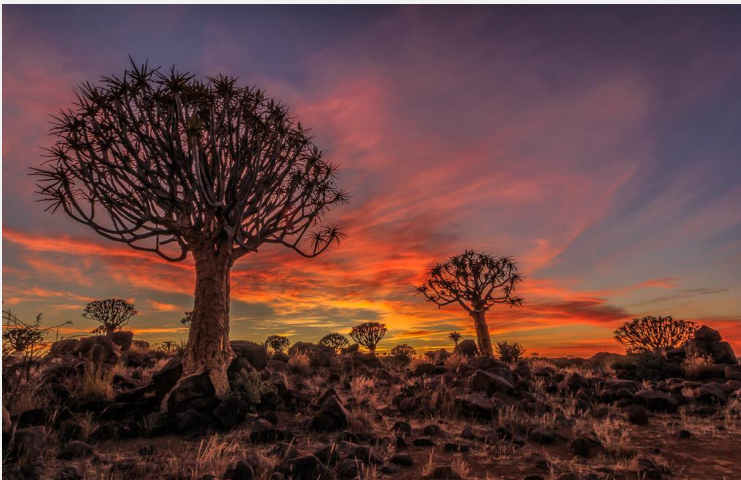
Quiver Tree