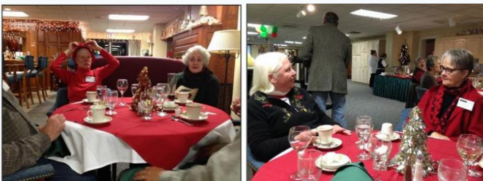
Photos from 2015 HCC Christmas Dinner

W e will have our annual Christmas Dinner at our December 20 th meeting. The dinner will be catered by the folks at Noble just as it was last year. We had 18 members sign up and we typically request 20 before going with the catered option but we decided to move forward anyway. We will have a 50/50 raffle and the HCC funds will go towards offsetting the costs so hope you can participate for a chance to win! Remember the cost is $20/person. We had a great time last year so hope you can attend.