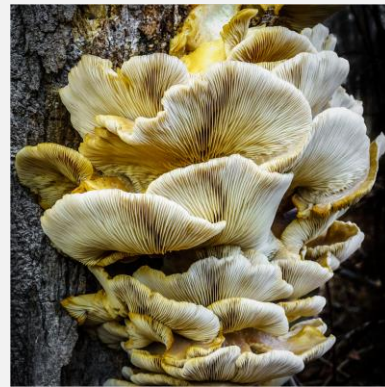
Growing Wild