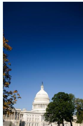
18mm (36mm equiv) | f/11 | 1/125 | Circular Polarizing Filter

The shot at left shows an extreme case of banding when zooming out to 10mm (15mm in 35mm equivalent). The polarizing effect is most intense in the middle of the frame, which was at around 90° to the sun. As you get both under and over that 90° the effect reduces, resulting in light bands. The shot at left shows that zooming in a bit can eliminate the problem. Where the precise threshold is varies based on things like angle to the sun, what’s in the frame, and what effect you’re aiming for.