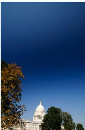
10mm (15mm equiv) | f/11 | 1/125 | Circular Polarizing Filter

With a wide-angle you can also end up with near black at the top of the frame. That can be a good or bad thing depending on what you’re going for. If you look at the sky in the immediate area around the dome in this shot, it’s roughly the same as the shot above. But because this shot is taken at the widest end of at 10-20mm lens and therefore the frame spans the area of the sky 90° from the sun, the blue at the top of frame is much darker. To my eye, the effect is overkill for this particular shot—the gradient is just too strong and sharp in the context of the whole frame—although there are some subjects where it can be used to great effect.