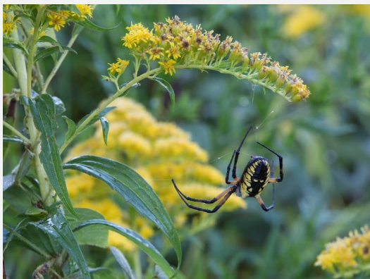
Making the Web