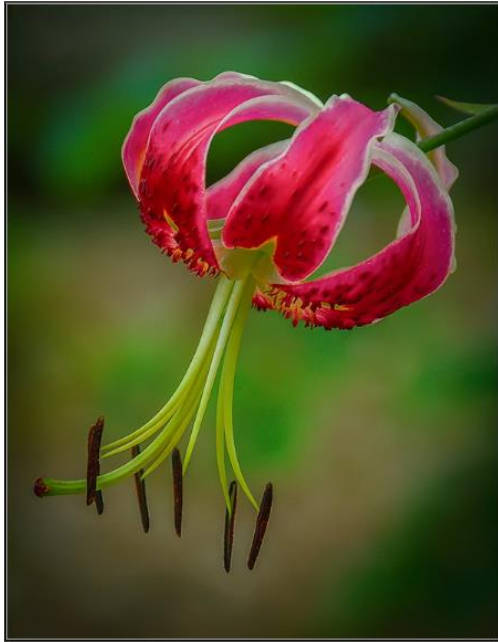
Delicate Flower