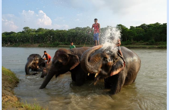
Taking a bath