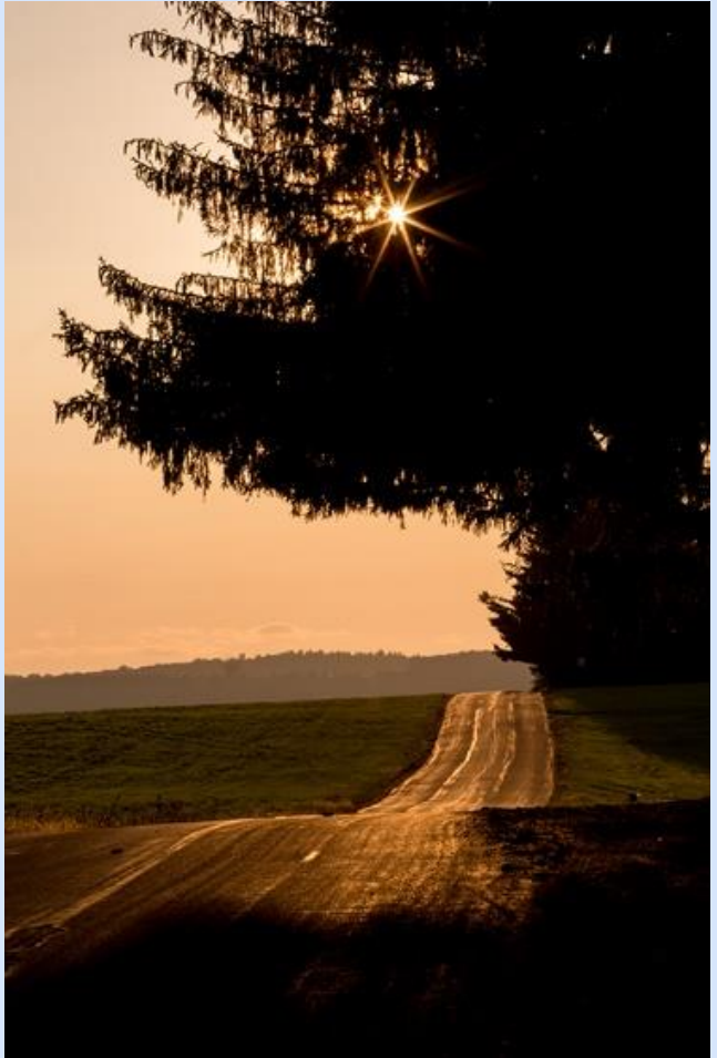
Road Less Traveled ©Brian Wilcox