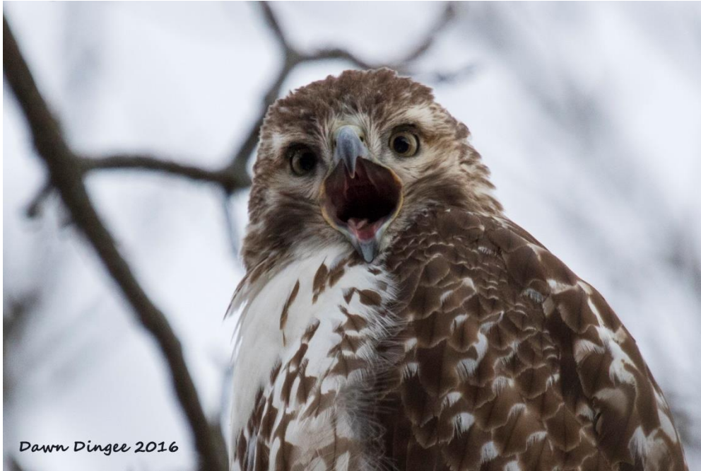
Dawn Dingee 2016