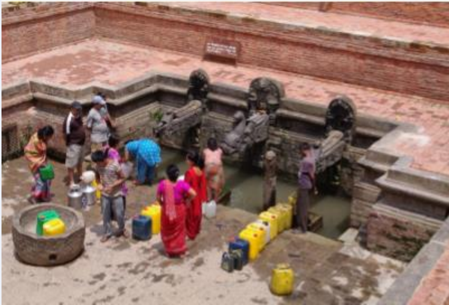
Collecting precious water