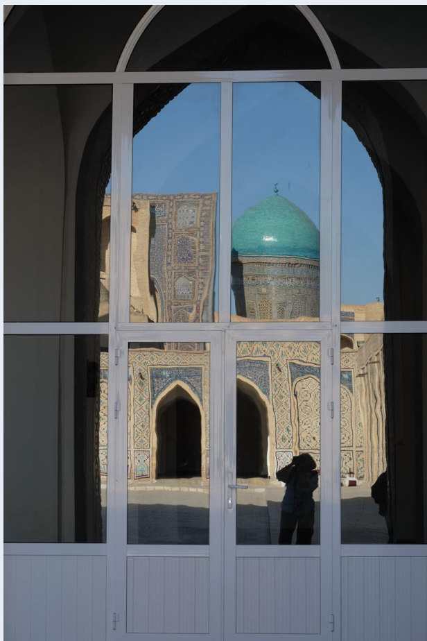
Accidental Selfie

Each month we feature a topic of the months in the newsletter. Members are encouraged to submit 2-3 photos to select from. This month's topic was " Unusual Perspective ".