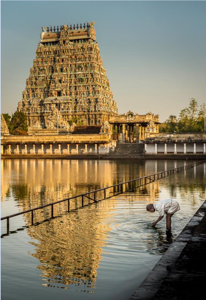
Chidambaram India