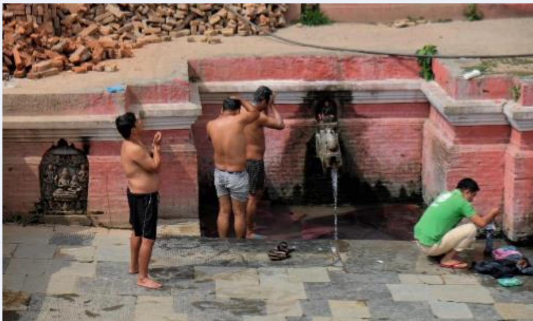
Taking a shower