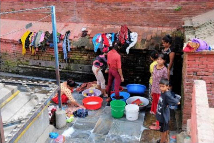
Washing family laundry