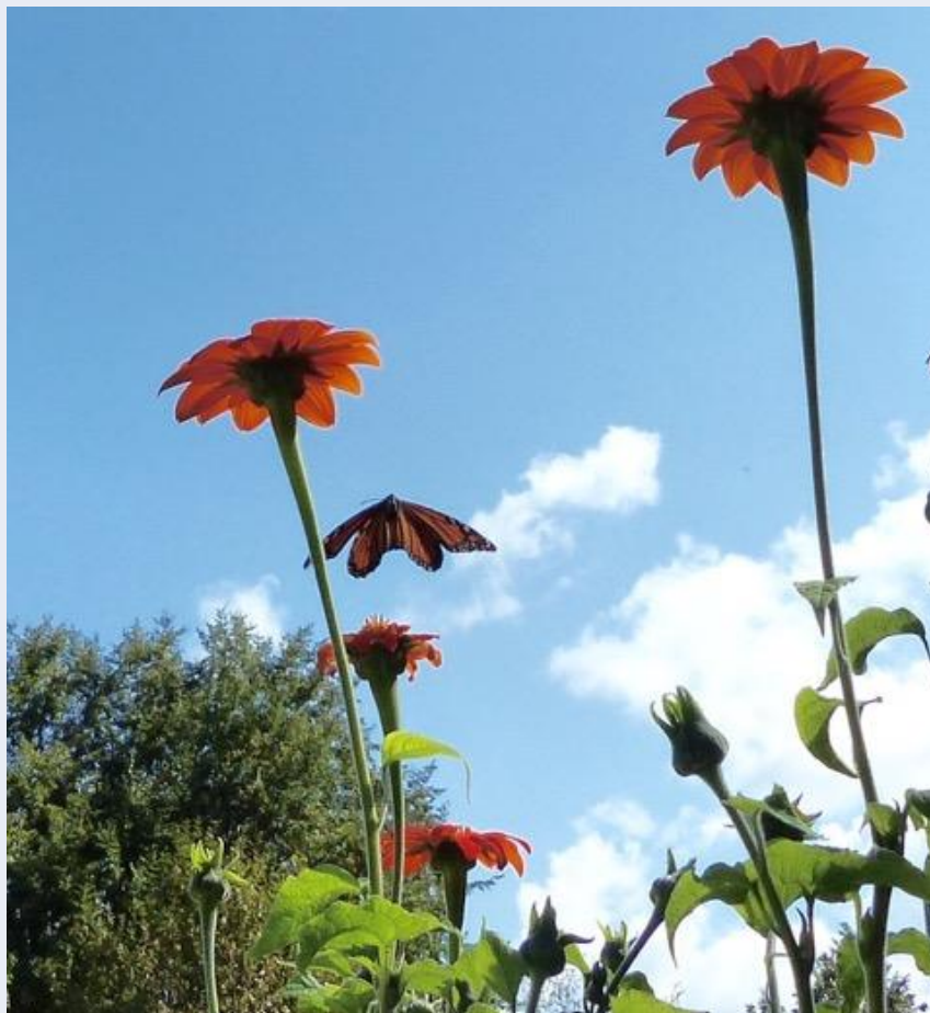
Mexican Sunflowers and Monarch ©Judith Gott