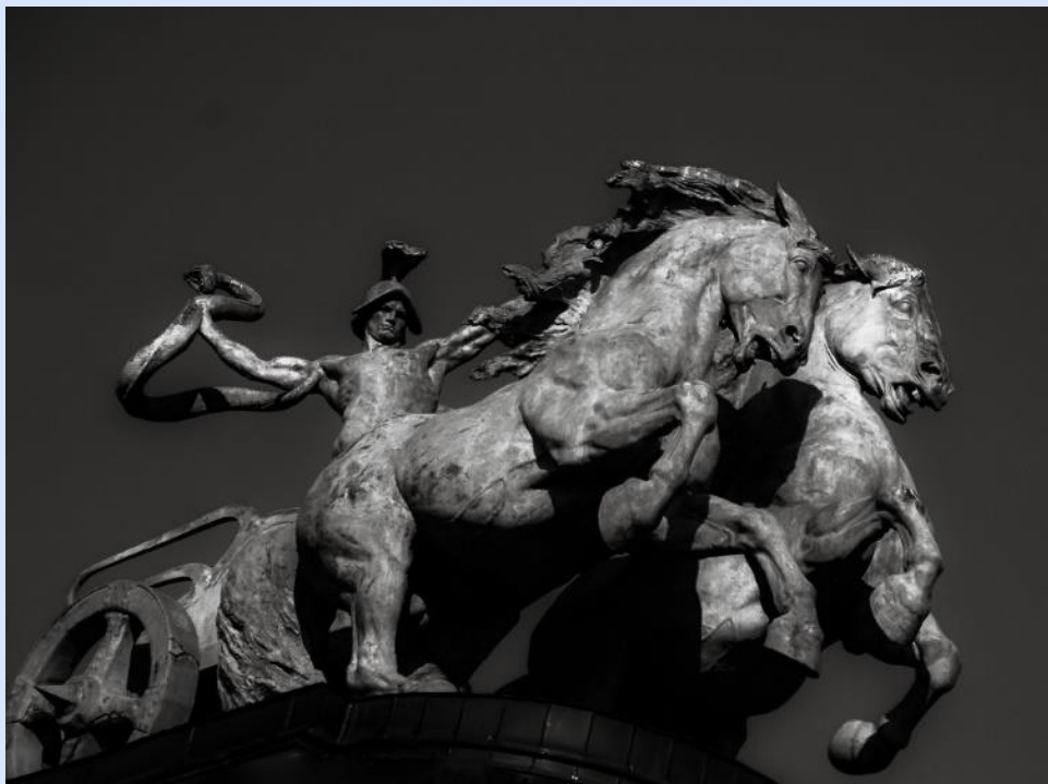
Hero's Square