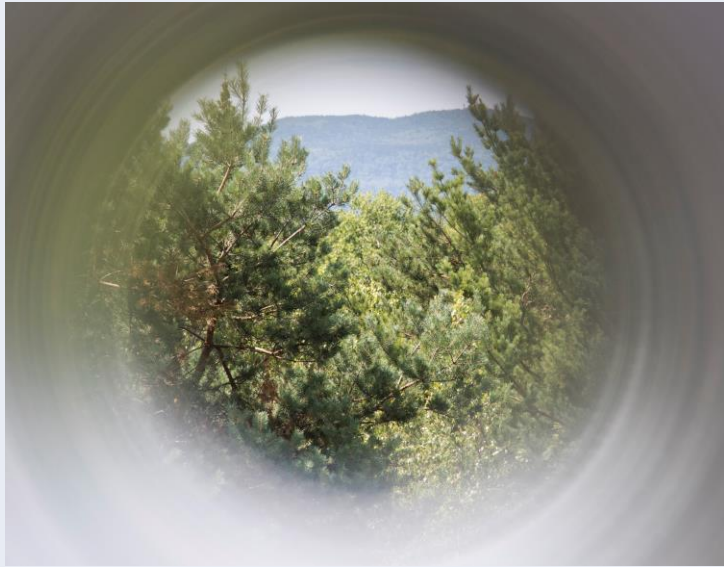
Tunnel View