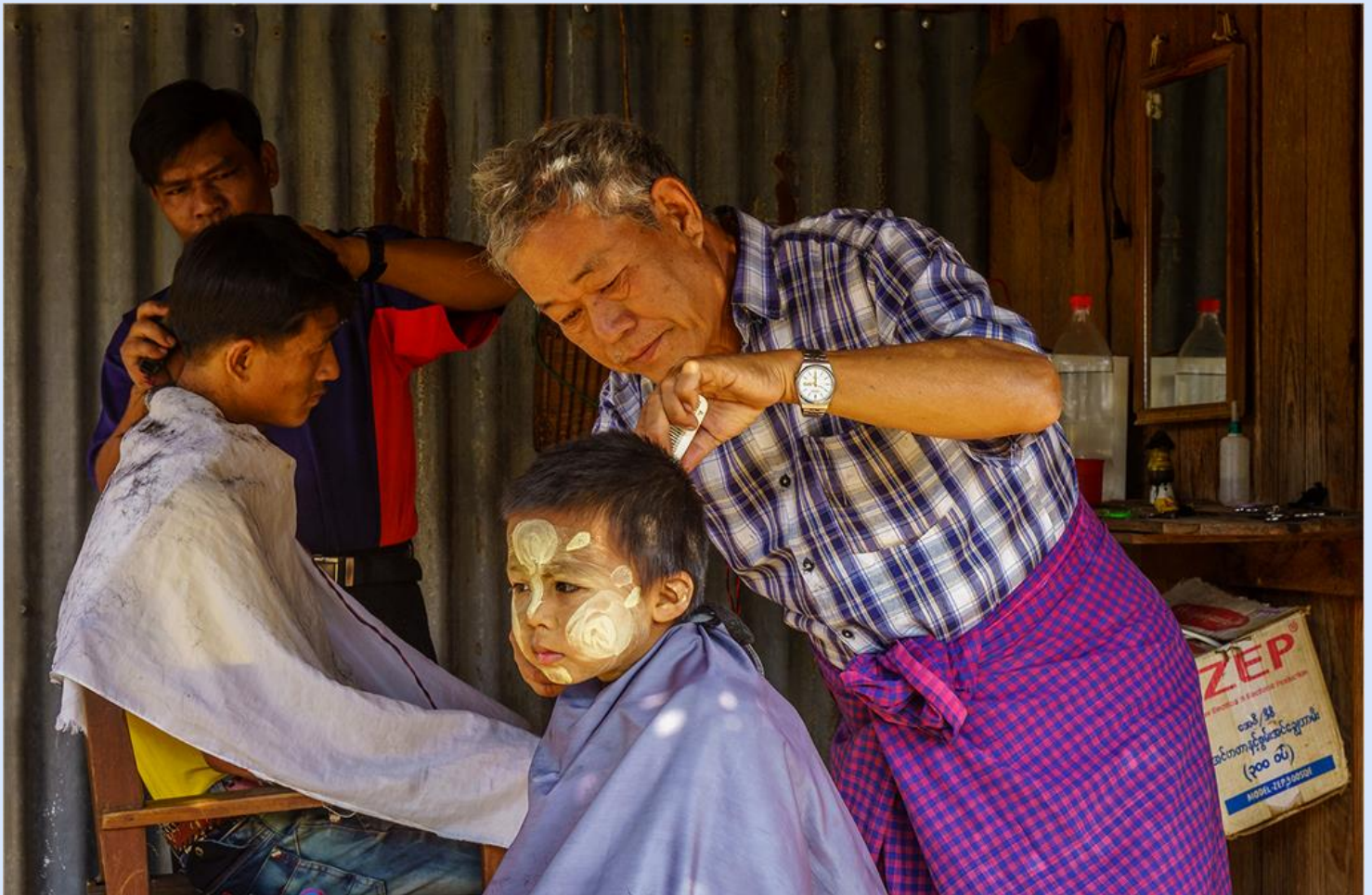
At the Barber