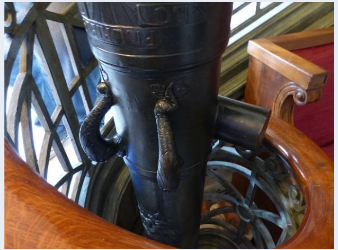
West Point Cullum Hall Stairs to Ballroom