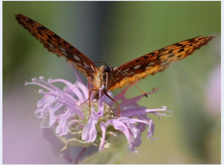
Watchful Eyes