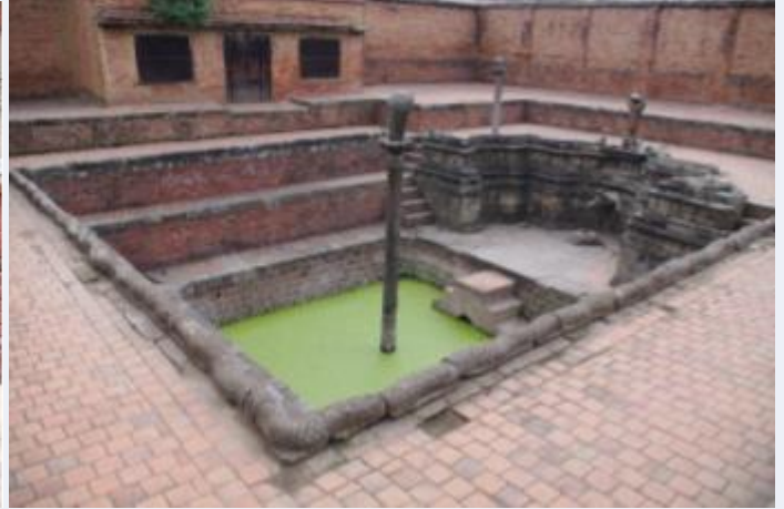
An ancient fountain before earthquake