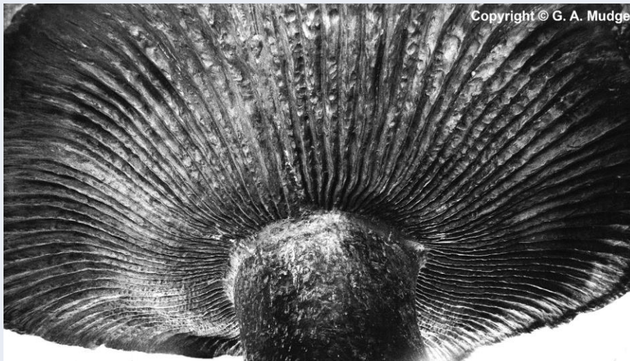
From Bottom of Mushroom