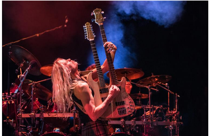
Guitar Hero