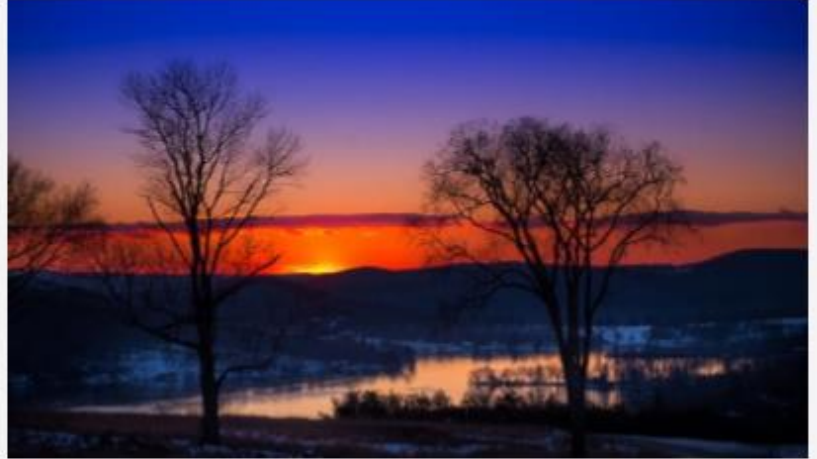
Sunset over Lake Waramaug