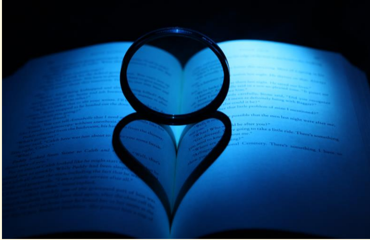
Heart

Each month we feature a topic of the months in the newsletter. Members are encouraged to submit 2-3 photos to select from. This month's topic was "Still Life".