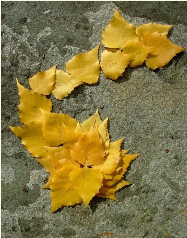
In The Style Of Andy Goldsworthy