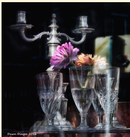
Window dressing

Topic for May's newsletter: Black & White