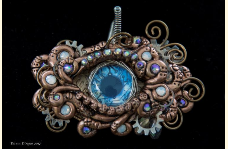
Jewelry ©Dawn Dingee