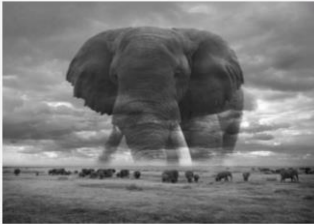
Amboseli Guardian