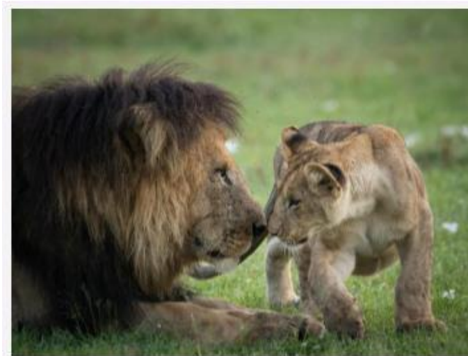
What's up Dad