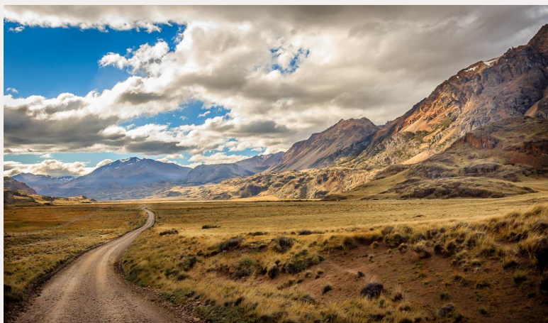
Road to Argentina