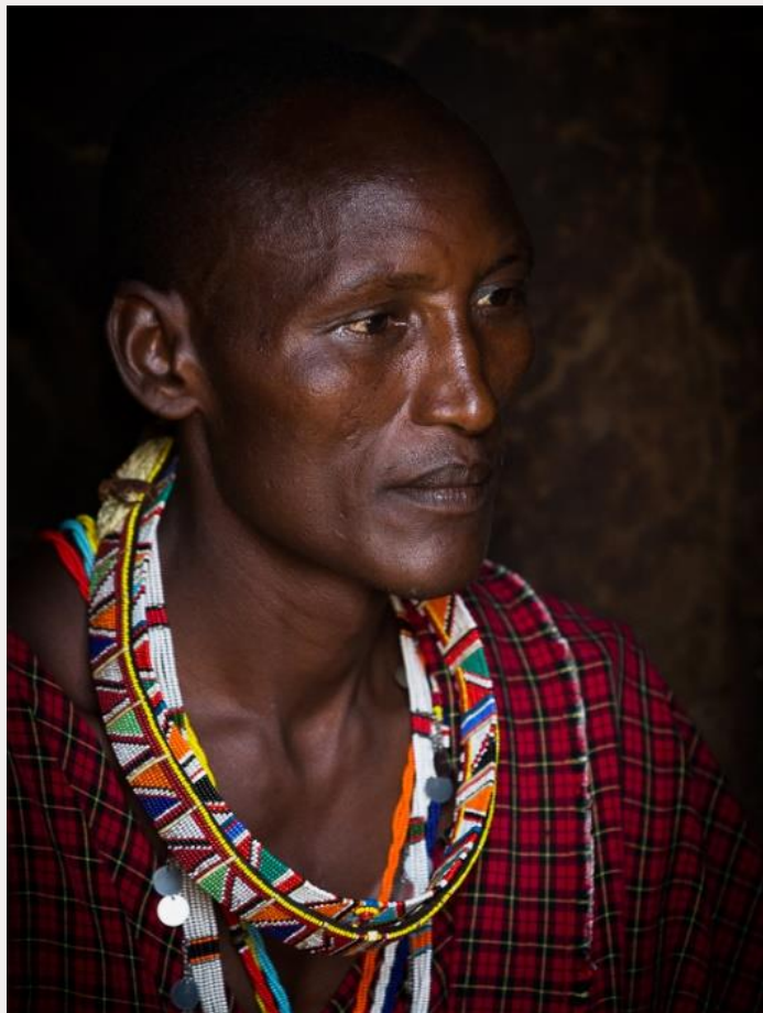
Amboseli Maasai Warrior

The following photos received the highest club votes and were submitted to PSA to represent the Housatonic Camera Club in the Winter Projected Image Division competition. Thank you to all who submitted photos and/or participated in the voting. The top 6 scoring pictures by 6 different makers is selected.