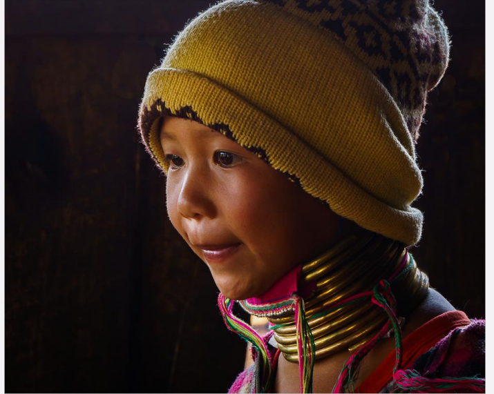
Padaung Girl ©Bert Schmitz