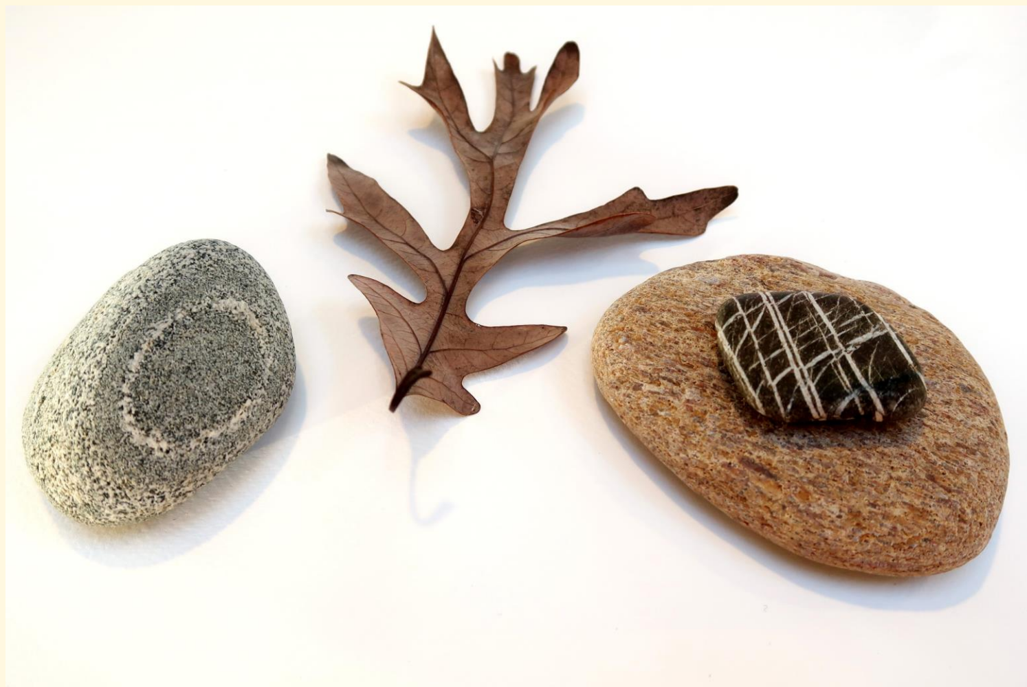
Beach stones and leaf