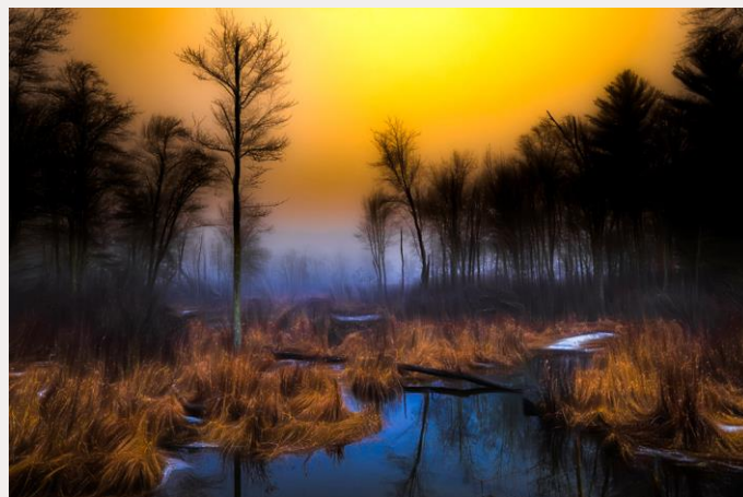
Sunrise at the swamp