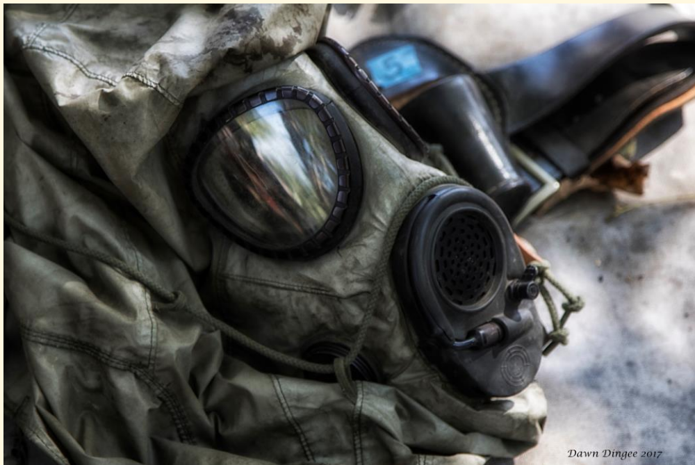
Dawn Dingee 2017