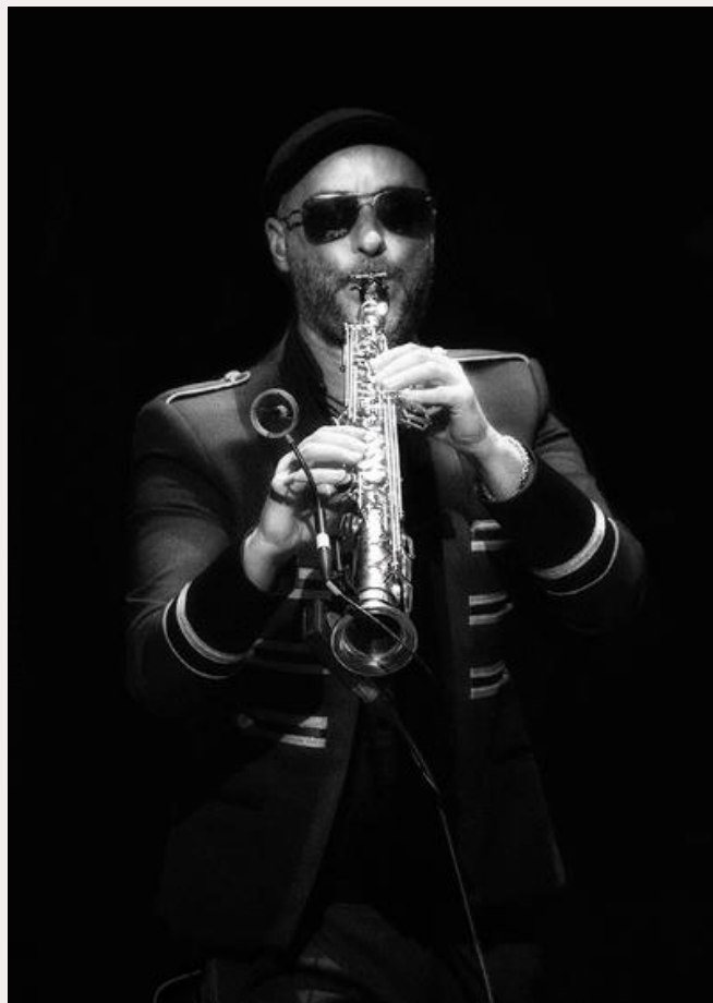
Play me a song