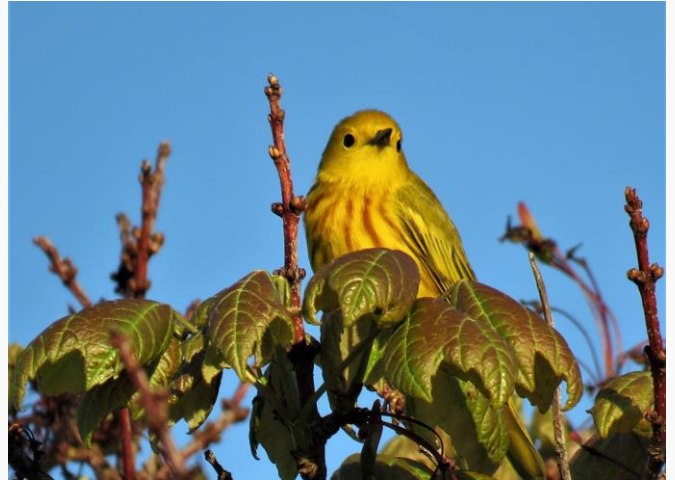
Returning Warbler