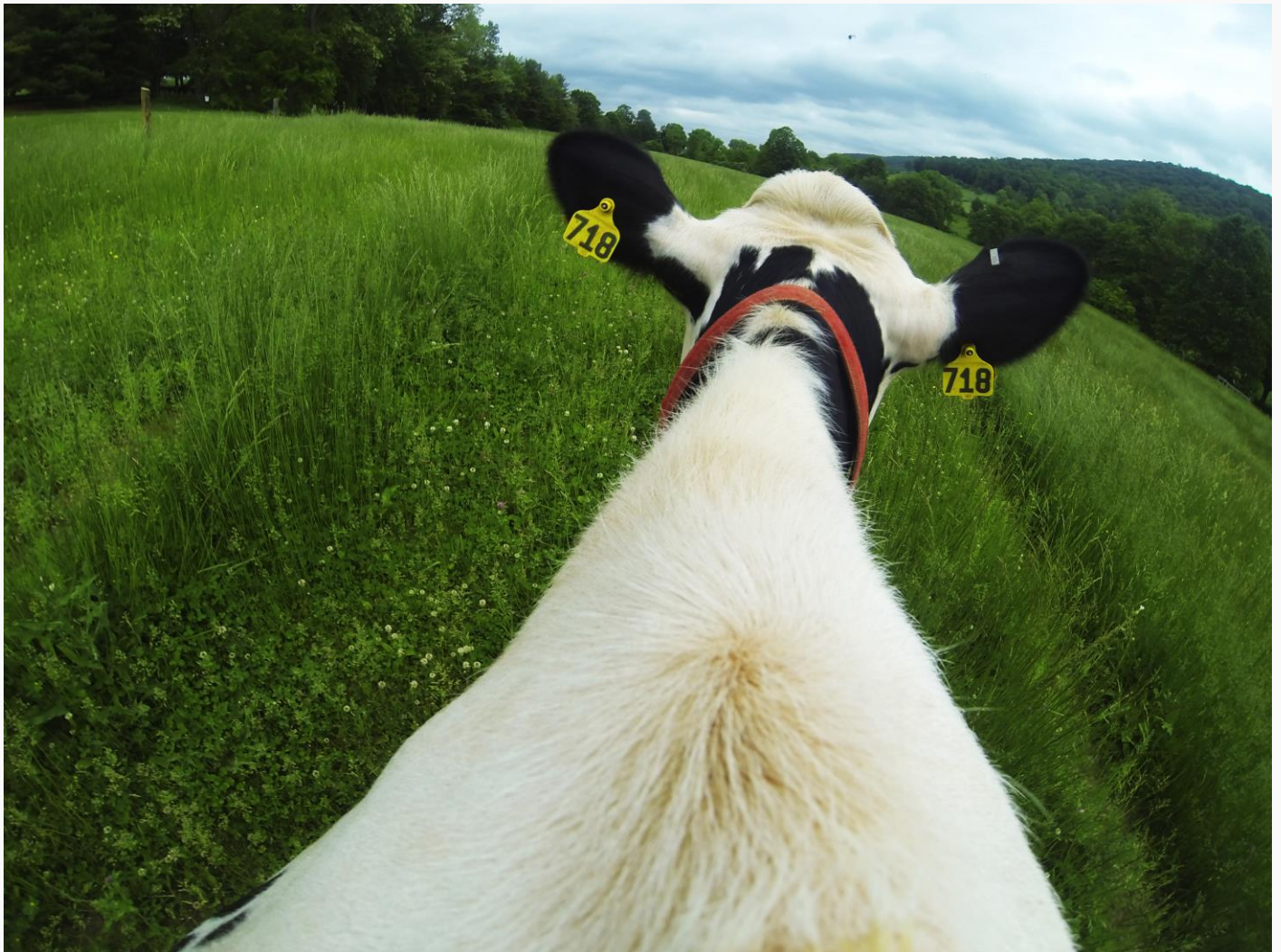
Spring time is looking forward to green grass