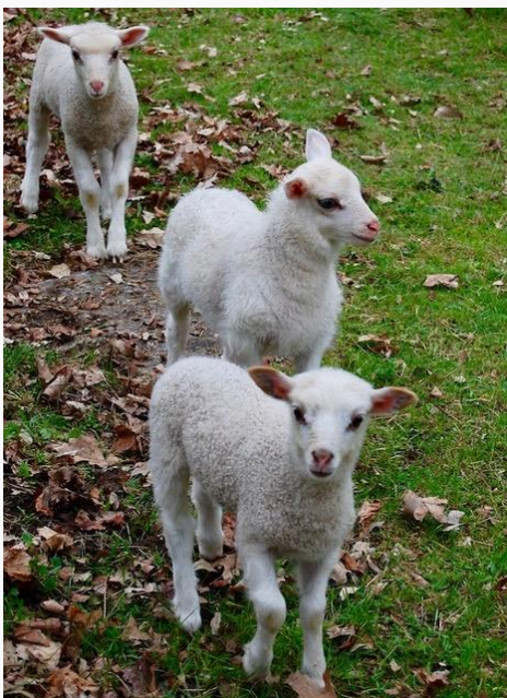
Young Ones