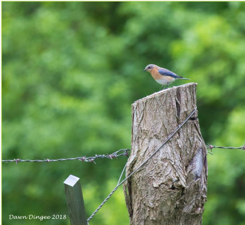
Eastern Bluebird

Each month we feature a topic of the months in the newsletter. Members are encouraged to submit 2-3 photos to select from. This month’s topic was “It’s a Spring Thing”.