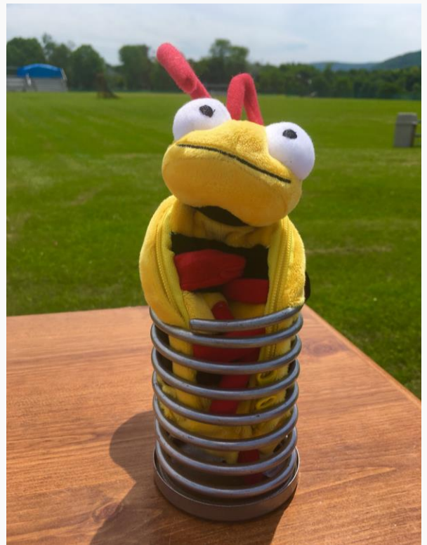
Let it Bee Spring