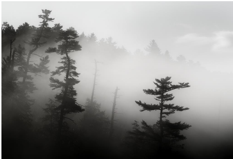
Twisting in the Fog Lazlo Gyorsok