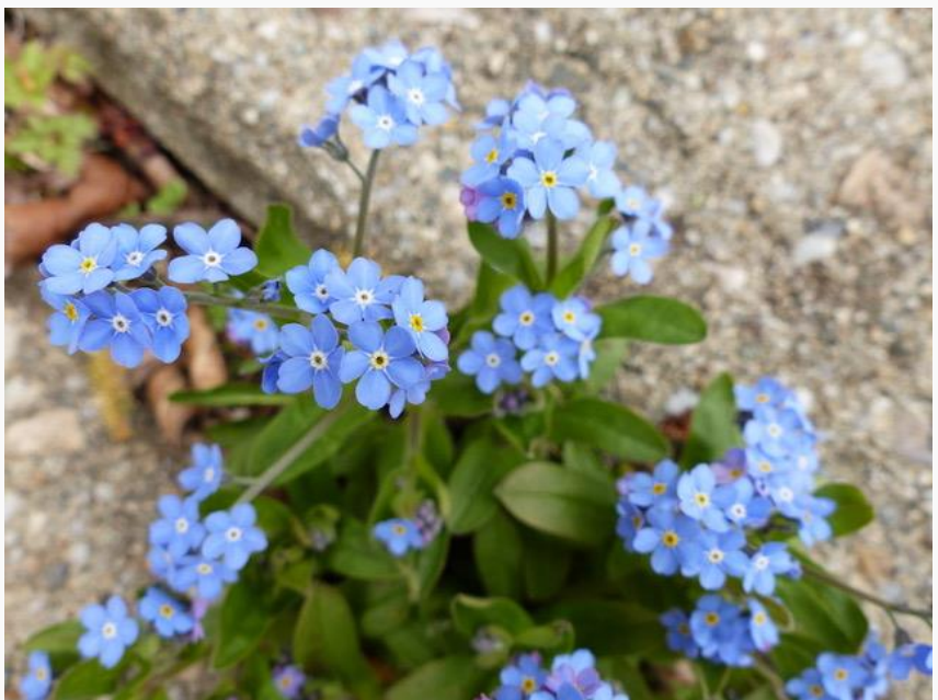
Forget Me Not