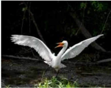
Egret - Lazlo Gyorsok