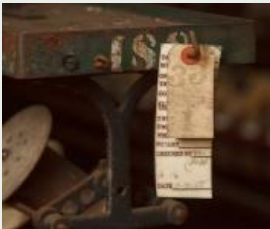
Inspected by 33 - Dawn Dingee