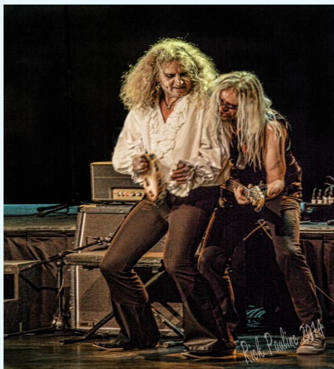
"Blonde on Blonde" (Nad Sylvan and Nick Beggs)