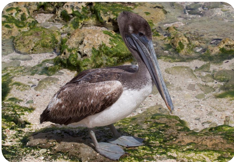
"Brown Pelican "