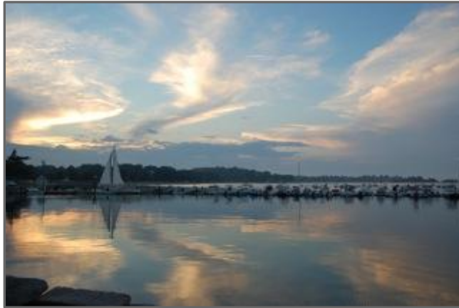
"Harmony Sail"

Meetings: 3rd Tuesday of the Month (Sept - June) Where: Noble Horizons, 17 Cobble Rd, Salisbury, CT Time: 7:00 pm (open to the public)