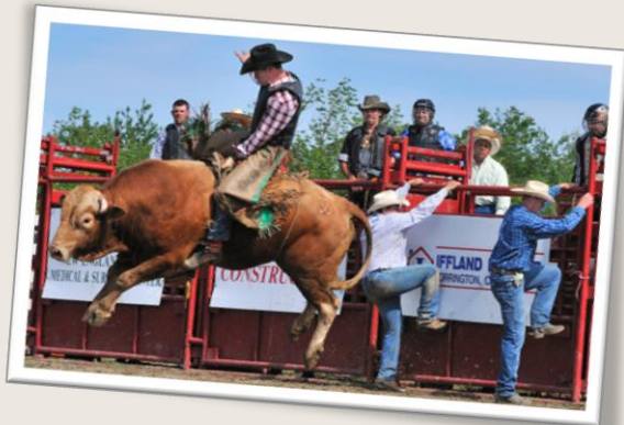
Get Out of the Way