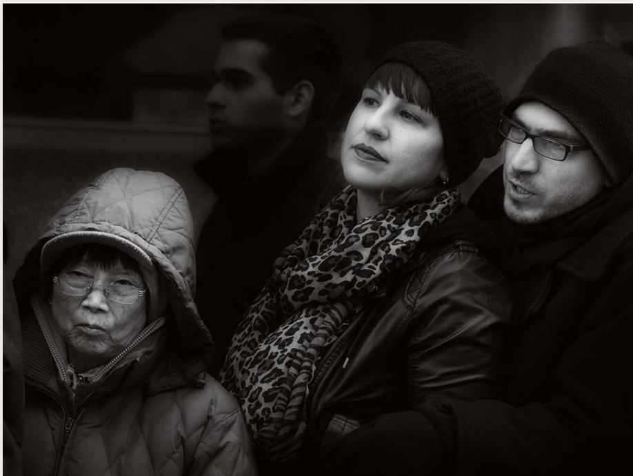
Watching the Parade