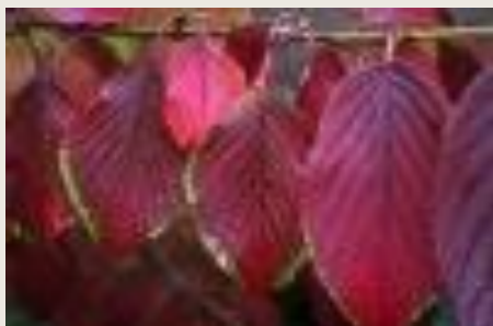
Hanging Leaves

June 18: End of Year Dinner and Members Showcase.