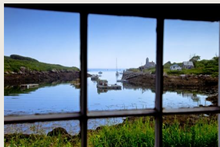
Damaris Cove Bridge - Photographer Brian Wilcox