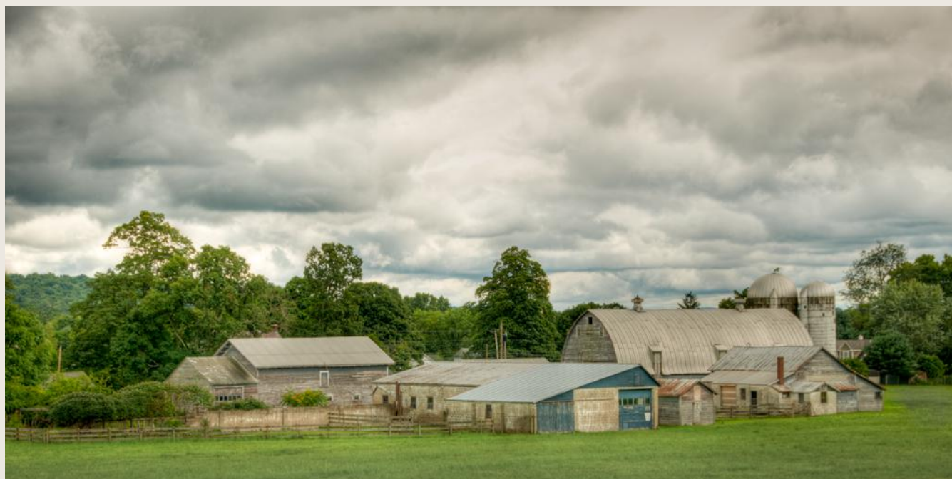
Frank Brothers Dairy Farm