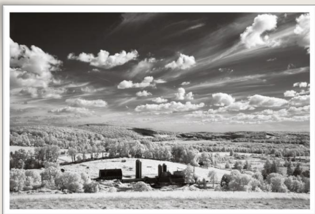
Hammond Farm

Digital 'post-production' workflow resembles that for other B&W images, with a few additional considerations. Our presentation will demonstrate several approaches from camera file through to finished IR image.