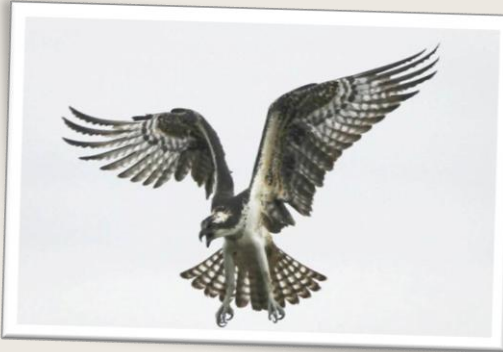
Osprey