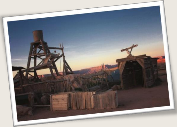
Lost Horse Mine - Photographer Dawn Dingee