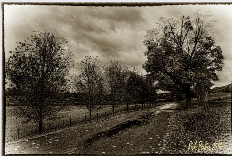
"Already Gone"