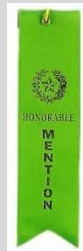
Dawn Dingee received HM for "Blue Heron on Watch"

To all photo club members, for future editions of the newsletter, please consider submitting: