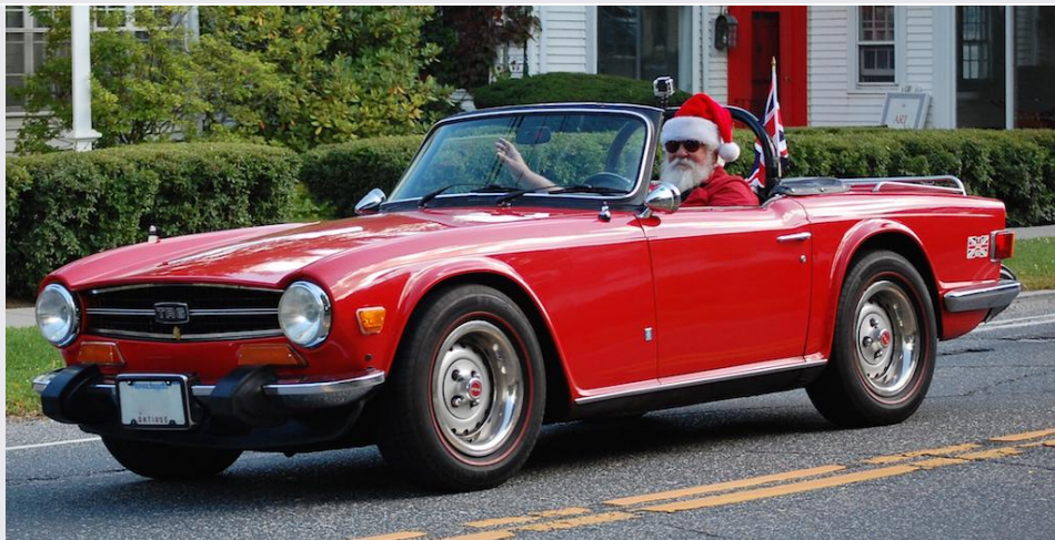
Vintage Santa