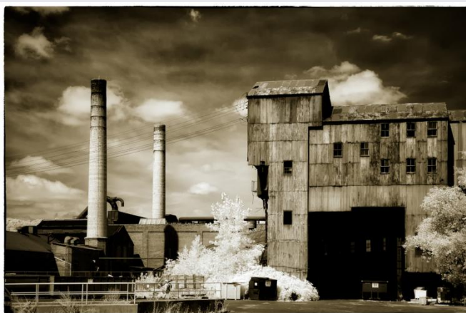
"Old Barn"