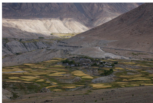
Birgitt Parjarola "Harvest In 14,000 ft" 8 pts.