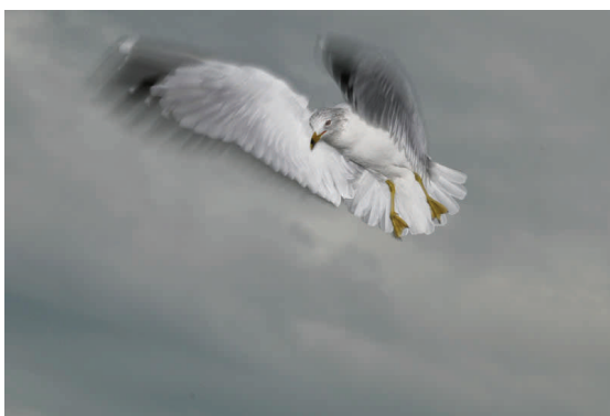
Rita Mathews "Ringed Bill Gull" 9 pts.