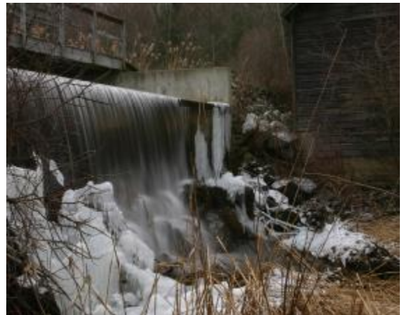
Spring Thaw