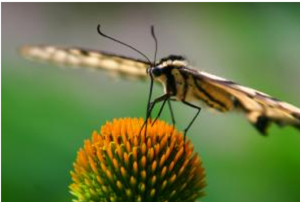
Swallowtail on Echinacea